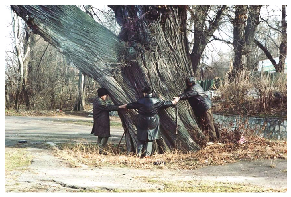
Figure 2. The photograph shows the twisted trunk of the elm of Calafat

In 2011, the circumference of the big elm was measured again and had a value cbh = 6.70 m.