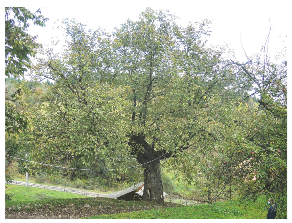
Figure 4. General view of the wych elm of Sadova

ADRIAN PATRUT, ROXANA T. PATRUT, VICTOR BOCOS-BINTINTAN, ILEANA-ANDREEA RATIU, LASZLO RAKOSY, GEORGE ZDROB, EUFROSINA VANCA, KARL F. VON REDEN