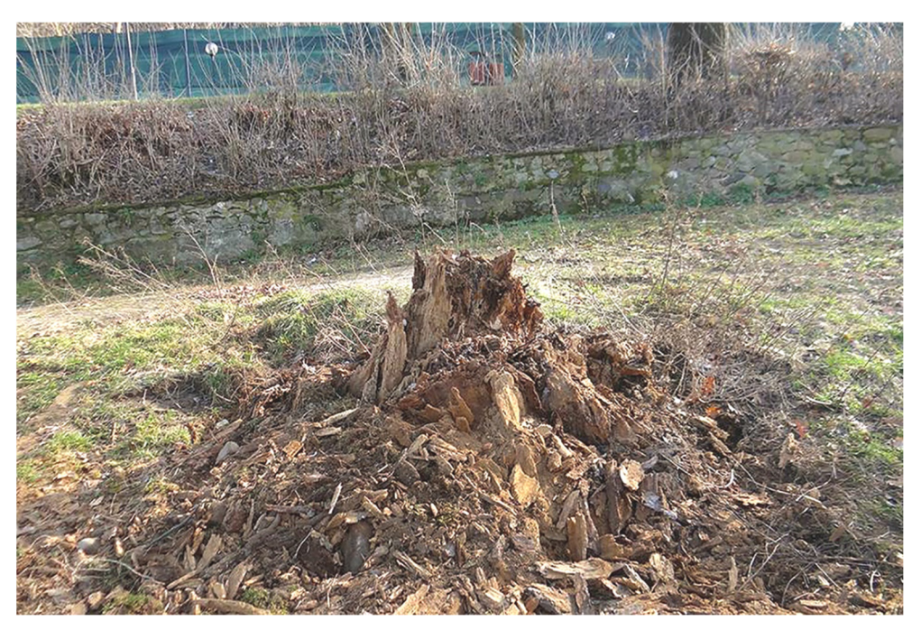
Figure 3. Image of the mutilated stump of the elm of Calafat

The wych elm of Sadova and its area. The multi-centennial wych elm ( Ulmus glabra ) is located in the Sadova village, a suburb of Campulung Moldovenesc city, Suceava county, Romania [17]. It can be found in a private garden, on a slope with south-eastern exposure, at a distance of around 50 m from a stream called Pârâul Morii, very close to its confluence with the Sadova stream. The GPS coordinates are 47°32.619' N, 025°31.573' E and the altitude is 659 m. The mean annual rainfall is 626 mm (Suceava station).