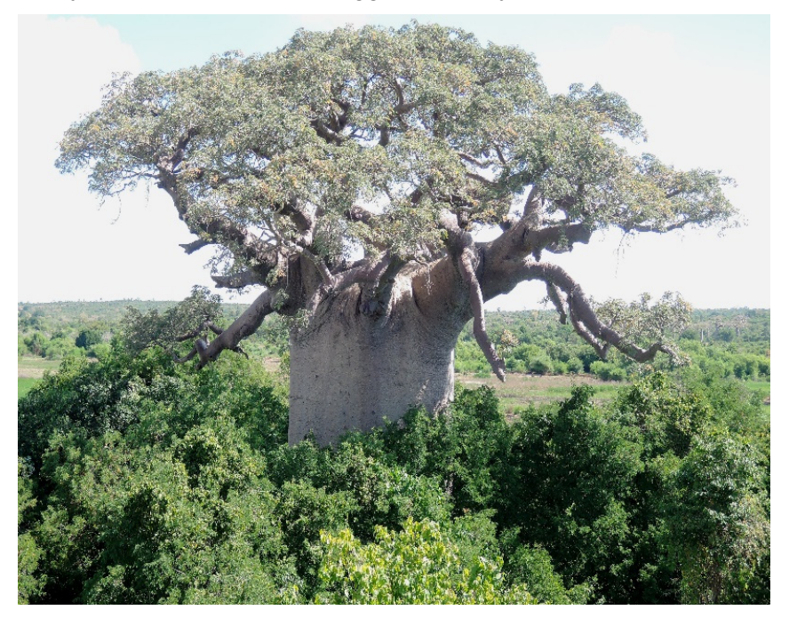
Figure 2. The picture taken from south-west shows the very large canopy of the Giant of Bevoay.

The calculated wood volume of the baobab is 520 m<sup>3</sup>, out of which 480 m<sup>3</sup> represents the trunk and 40 m<sup>3</sup> the canopy. By this value, the Giant of Bevoay becomes the third largest Adansonia grandidieri in volume after the Big Reniala of Isosa and the famous fallen Tsitakakoike, both from the Andombiry Forest [21]. It is also bigger than any known African baobab.