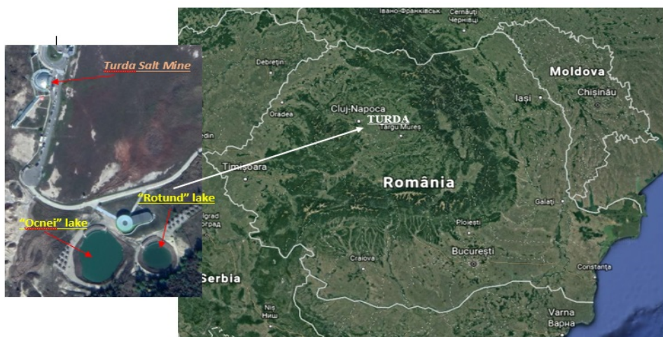
Figure 1. Location of the salt lakes from the protected area "Salina Turda"

In order to carry out physico-chemical analyzes of the water lakes from the "Salina Turda" area, the water samples were taken from different depths, namely: from the level of the water mirror (- 0.3 meters), -1 meter, - 2 meters, - 3 meters and as well as - 4 meters.