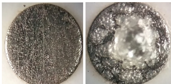
Figure 1. Magnified images (x 400) of Co-Cr and Co-Cr/Gel-Nafion surfaces.

In Figure 1 is presented the electrode surface before and after deposition of the whitening gel used in bleaching treatment of teeth obtained with an optical microscope. The exposure of the metallic interface with whitening gel containing aggressive H_2O_2 lead to affect the integrity of the thin protective oxide passive layer formed at the metallic surface in contact with the air.